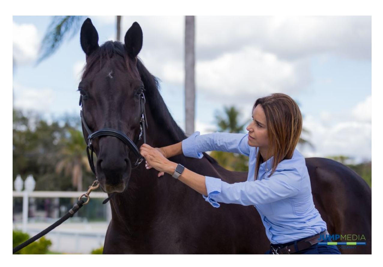
Palm Beach Equine Clinic often uses alternative medicine in conjunction with traditional medicine therapies to enchance a horse's overall health.

Employing a holistic approach to treating patients, Palm Beach Equine Clinic considers all the available avenues for health care. Alternative medicine therapies are often used in conjunction with traditional medicine and can be uniquely tailored to enhance a horse's performance and overall health. Alternative medicine offerings include acupuncture, equine medical manipulation adjustments, Chinese herbal medicine, laser therapy (photobiomodulation), and extracorporeal shockwave.