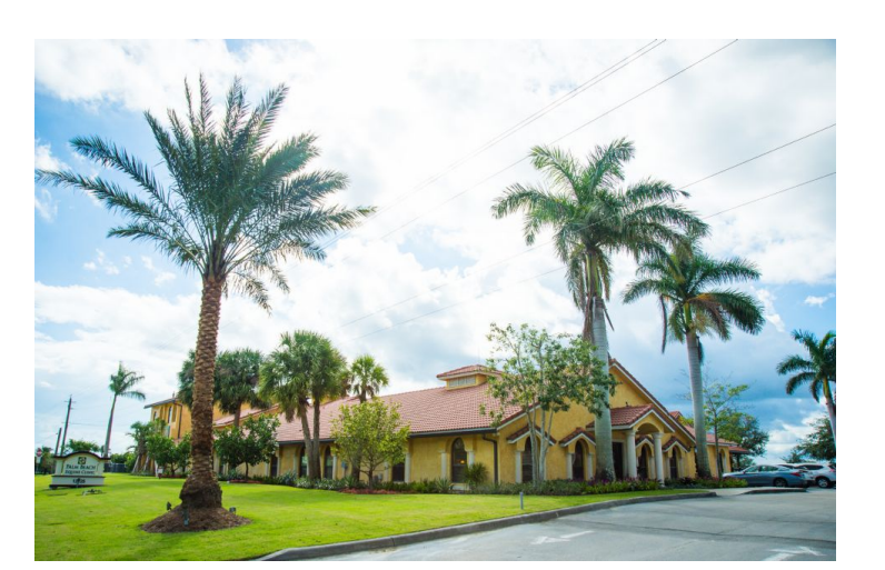
At the main facility, Palm Beach Equine Clinic has a team of more than 30 veterinarians offering a wide variety of services.

At its main facility, Palm Beach Equine Clinic has an extensive team of more than 30 veterinarians offering a wide variety of services and remedies including internal medicine, emergency care, reproduction and fertility, alternative medicine, regenerative medicine, dentistry, podiatry, and more. From sport horse evaluations to non-traditional alternative medicine therapies such as equine medical manipulation and acupuncture, Palm Beach Equine Clinic veterinarians think outside of the box to prevent and treat injuries.